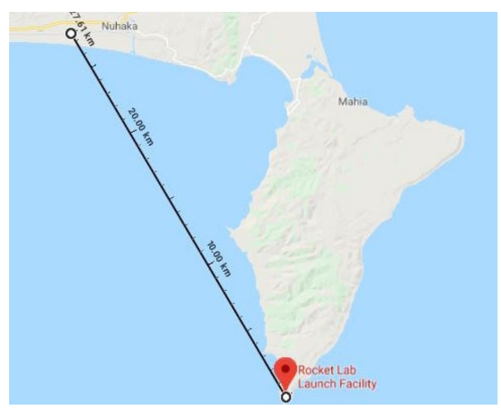
OLAUNCH VIEWING AREA'S DISTANCE FROM ROCKET LAB LC-1

As Rocket Lab's top priority during the test launch is public safety, there are safety zones in place during a launch and no access will be permitted to Onenui Station where Launch Complex 1 is located.