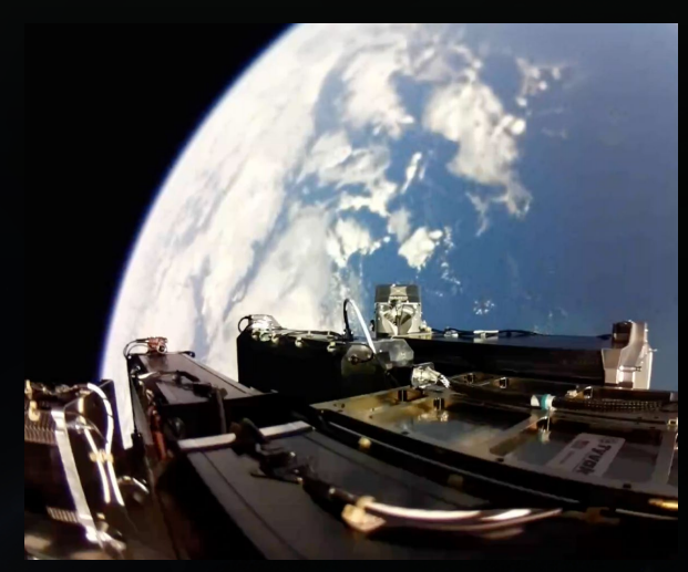
O PAYLOADS ON THE KICK STAGE ON MISSION 'ITS BUSINESS TIME' | Space, 2018

BY DOING THIS WE LEAVE NOTHING IN ORBIT BUT OUR CUSTOMERS' SATELLITES - THE WAY IT SHOULD BE.