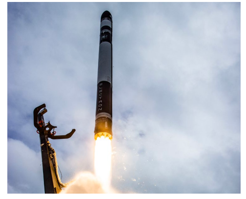
'R3D2' MISSION LIFTS OFF FROM ROCKET LAB LC-1 March 2019

For information on launch day visit www.rocketlabusa.com/next-mission/launch-complex-1 and follow Rocket Lab on Twitter @RocketLab.