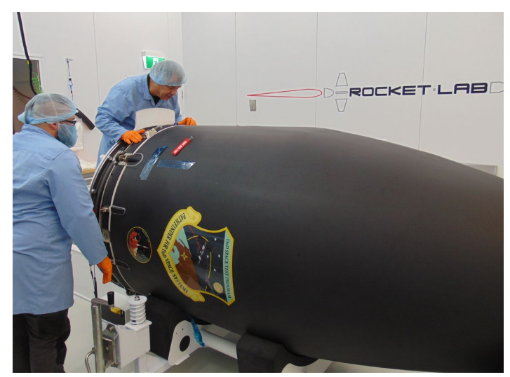
ENCAPSULATION OF THE STP-27RD PAYLOADS | April 2019

The Space Test Program (STP) is a US Government organization responsible for mission design, spacecraft acquisition, integration, launch, and onorbit operations for the Department of Defense's most innovative space experiments, technologies and demonstrations. Many of the technologies crucial to the functioning of today's society began as risk reduction experiments with STP, including the Global Positioning System (GPS) and the climate monitoring Joint Polar Satellite System (JPSS). STP has enabled pathfinder missions that accelerate development of breakthrough technologies such as ionosphere monitoring, laser communications, solar storm warning systems, space debris tracking, solar sails and next-generation atomic clocks.