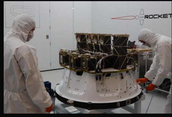
○ 'ELANA-19' PAYLOAD INTEGRATION ON THE KICK STAGE | 2018

After all payloads are deployed, the Kick Stage can reorient itself and reignite the Curie engine one last time to perform a deorbit maneuver. This drastically lowers the Kick Stage's orbit, enabling it to re-enter the atmosphere and burn up without a trace.