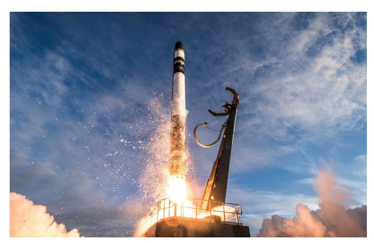
• LIFT OFF OF THE ELANA-19 MISSION FOR NASA FROM ROCKET LAB LAUNCH COMPLEX 1 | December, 2018 | Image credit: Trevor Mahlmann

Electron is launched from Rocket Lab Launch Complex 1, the world's only private orbital launch range. Located in Māhia, New Zealand, and licensed to launch up to 120 times per year, Rocket Lab can accommodate an unprecedented launch cadence and reach orbital inclinations from sun-synchronous through to 39 degrees from a single site. Rocket Lab is also developing a second launch site to provide unmatched schedule and launch location freedom. Launch Complex 2 is being built at the Mid-Atlantic Regional Spaceport in Wallops Flight Facility, Virginia, USA.