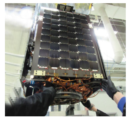
O HARBINGER | March 2019

The Space Plug and Play Architecture Research CubeSat-1 (SPARC-1) mission, sponsored by the Air Force Research Laboratory Space Vehicles Directorate (AFRL/RV), is a joint Swedish-United States experiment to explore technology developments in avionics miniaturization, software defined radio systems, and space situational awareness (SSA). The Falcon Orbital Debris Experiment (Falcon ODE), sponsored by the United States Air Force Academy, will evaluate ground-based tracking of space objects. Harbinger, a commercial small satellite built by York Space Systems and sponsored by the U.S Army, will demonstrate the ability of an experimental commercial system to meet DoD space capability requirements.