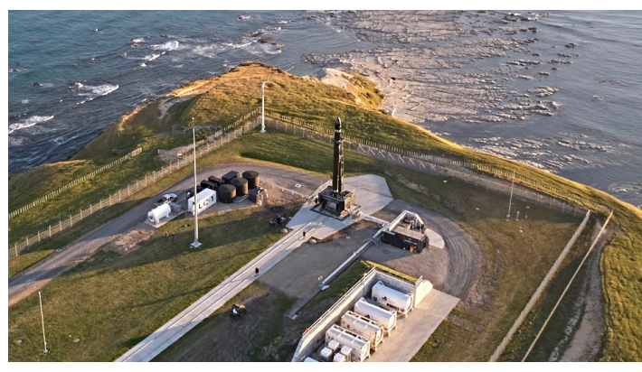
© ELECTRON AT ROCKET LAB LAUNCH COMPLEX 1 | Māhia Peninsula, 2017