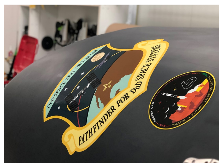
O FAIRING GRAPHICS ON ELECTRON FOR THE STP-27RD MISSION | March 2019