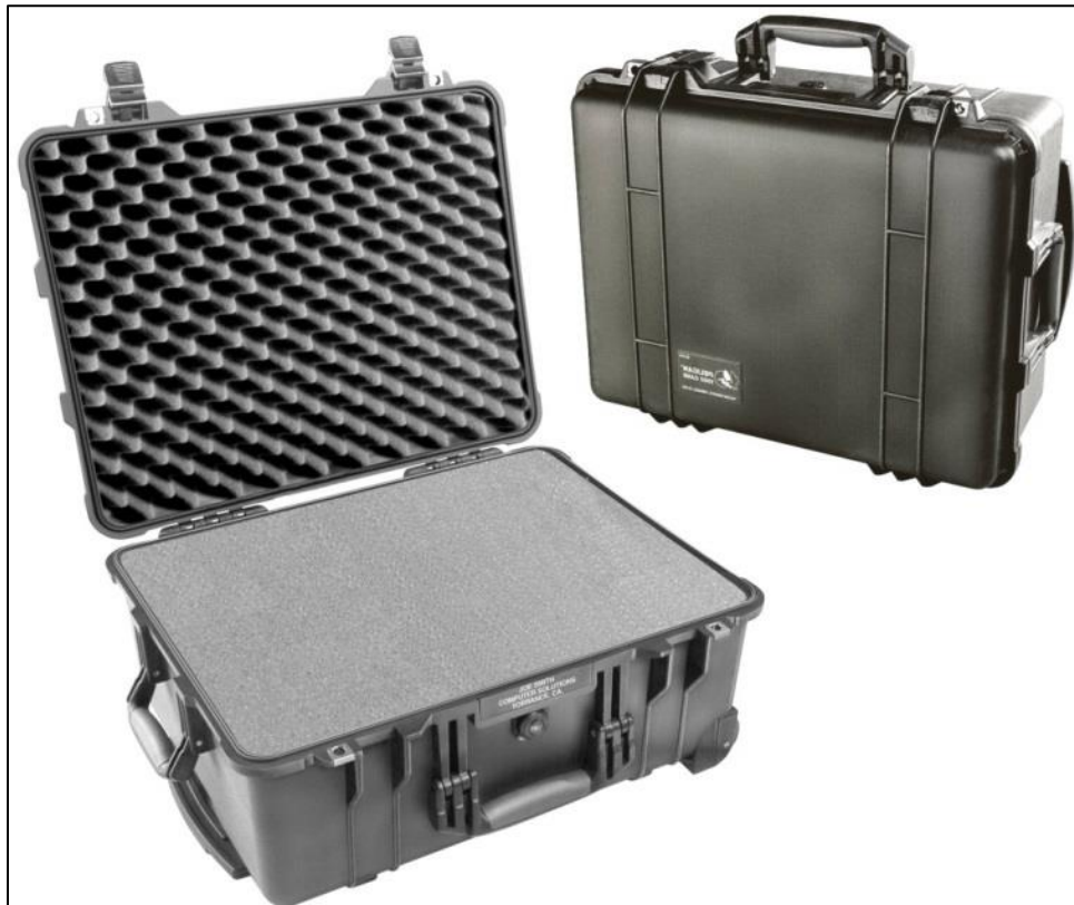
Figure 2-1: Typical 3U and 6U CSD shipping container

A Pelican case is the typical shipping container. CSDs shall only be shipped in these containers. Doing otherwise without PSC's approval will void the CSD warranty.