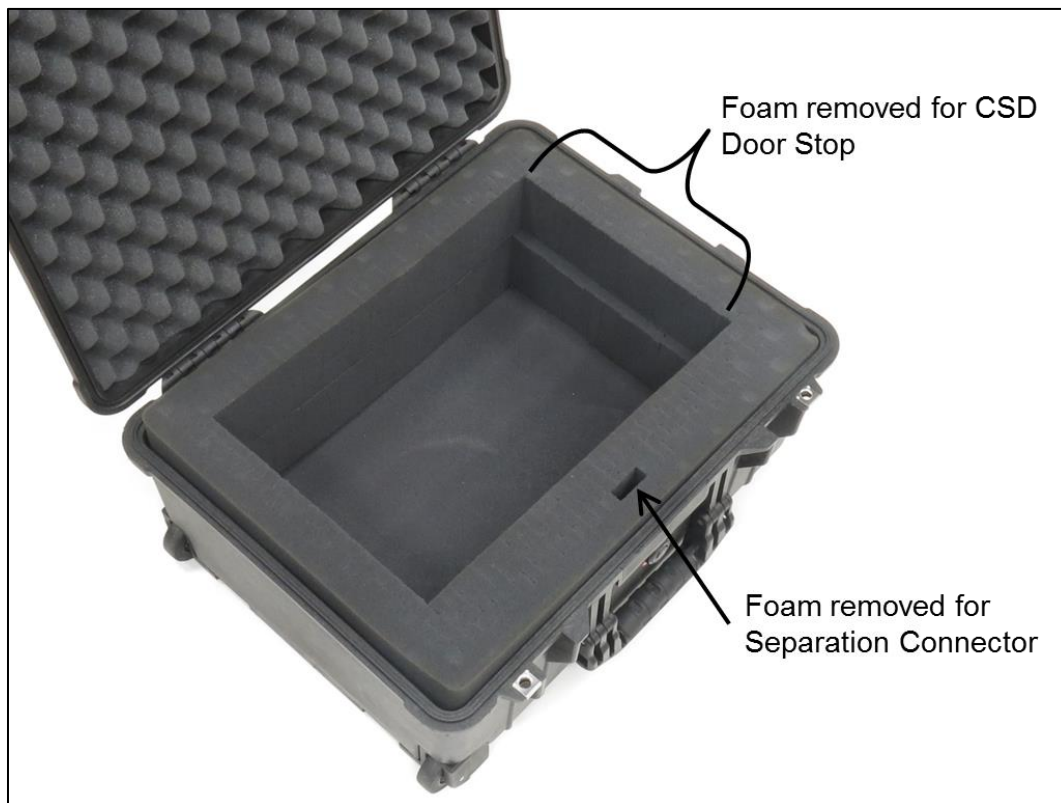
Figure 4-2: Pelican case Pick-N-Pluck foam removal