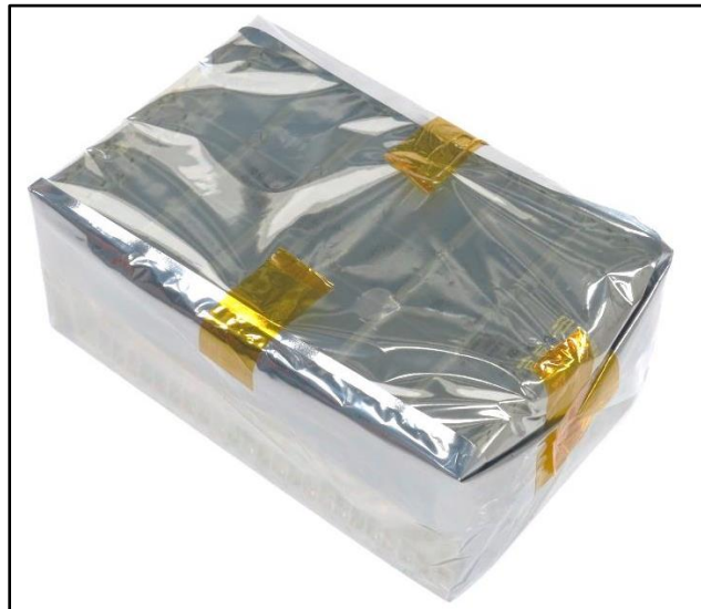
Figure 4-1: Bagged CSD