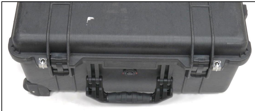
Figure 4-4: Pelican case secured with cable ties