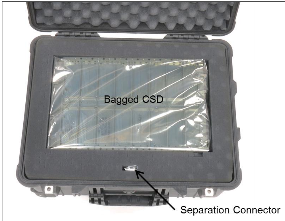
Figure 4-3: Bagged CSD and Separation Connector in case