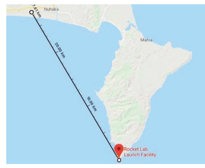
O LAUNCH VIEWING AREAS DISTANCE FROM ROCKET LAB LC-1

As Rocket Lab's top priority during launch is public safety, there are safety zones in place and no access will be permitted to Onenui Station where Launch Complex 1 is located.