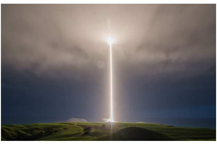
O LIFT OFF OF THE LOOK MA, NO HANDS MISSION | August 2019