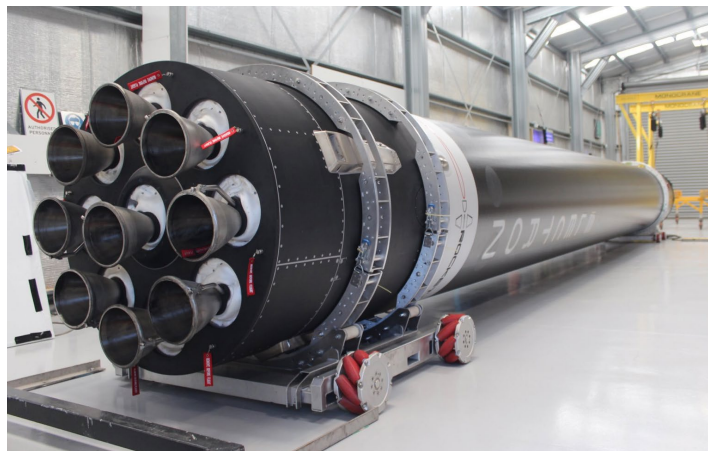
O AS THE CROW FLIES AHEAD OF PAYLOAD INTEGRATION AT LC-1 | August 2019

For information on launch day visit www.rocketlabusa.com/missions/next-mission/ and follow Rocket Lab on Twitter @RocketLab.